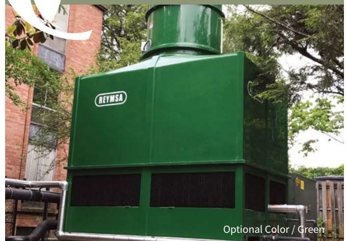
Optional Color / Green

It's not enough to be eco-friendly , you have to show it!