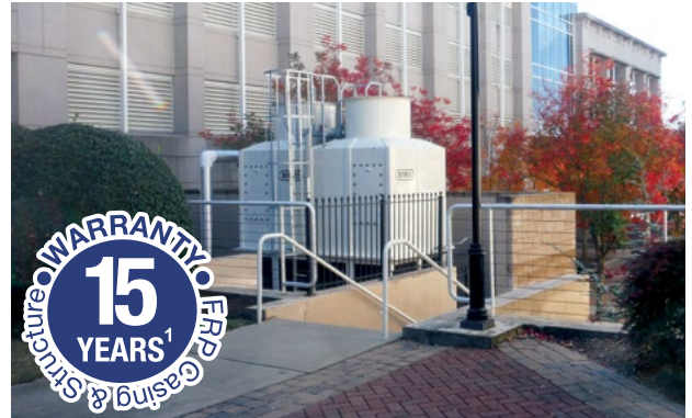
An eye-catching appearance results in public and workspace coming together.