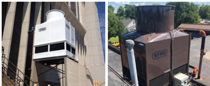
Optional Color / Tan

No enclosures needed - our cooling towers are the most aesthetically pleasing to the eye in the market.